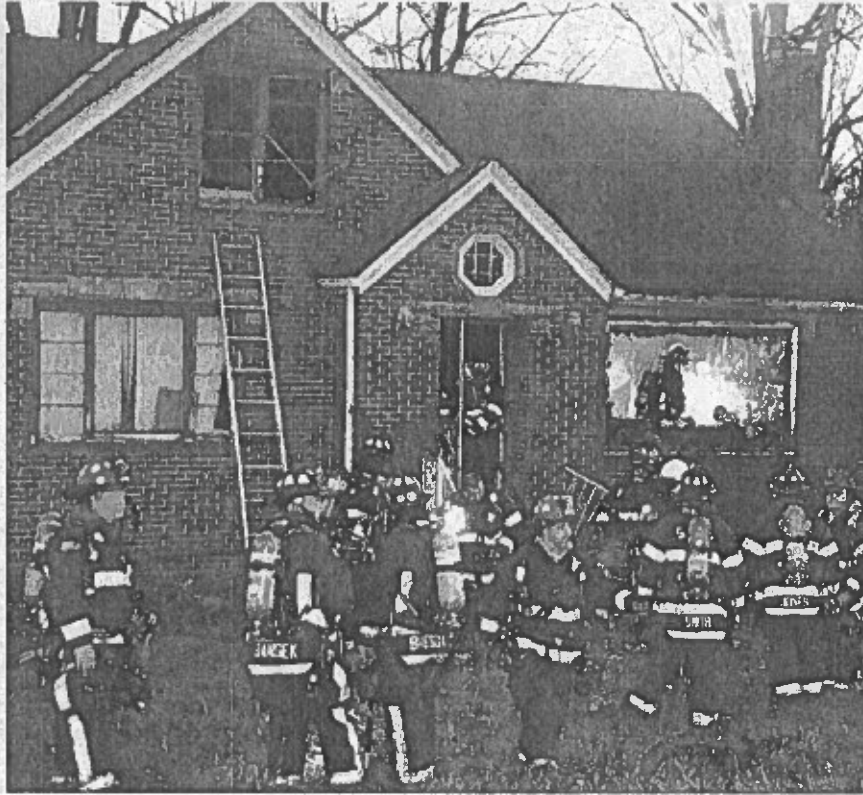
Firefighters from multiple departments at the scene of a fire at 43259 North Ridge Road. C